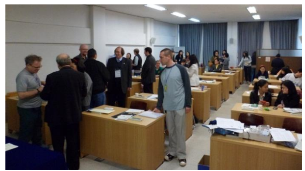
Networking between scheduled presentations at one of Gwangju-Jeonnam's chapter meetings. Scheduled for 20 minutes, break time often is extended to accommodate additional networking.

For more information, visit us regularly online on Facebook (Gwangju-Jeonnam KOTESOL) Chapter at our web and pages (http://www.koreatesol.org/GwangjuJeonna m). Send inquiries to gwangju kotesol@yahoo.com or chosunu@yahoo.com. We hope to see you at our upcoming Chapter events.