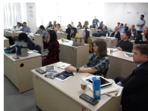
Cheongju Conference, Cheongju University

KOTESOL's International Conference will take place at COEX Convention Center from October 10 th to 11 th . Pre-conference workshops will take place on October 9 th . The conference website can be found here , while speaker profiles can be found here .