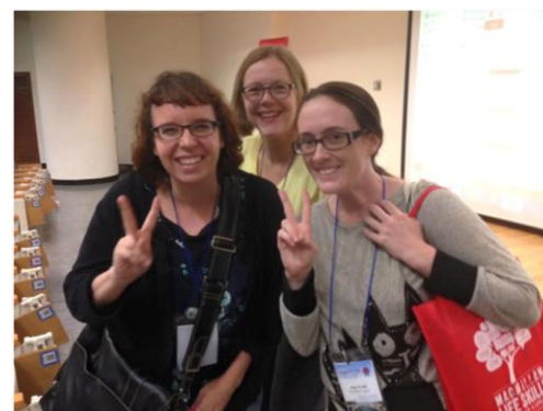
National Conference, Sookmyung University