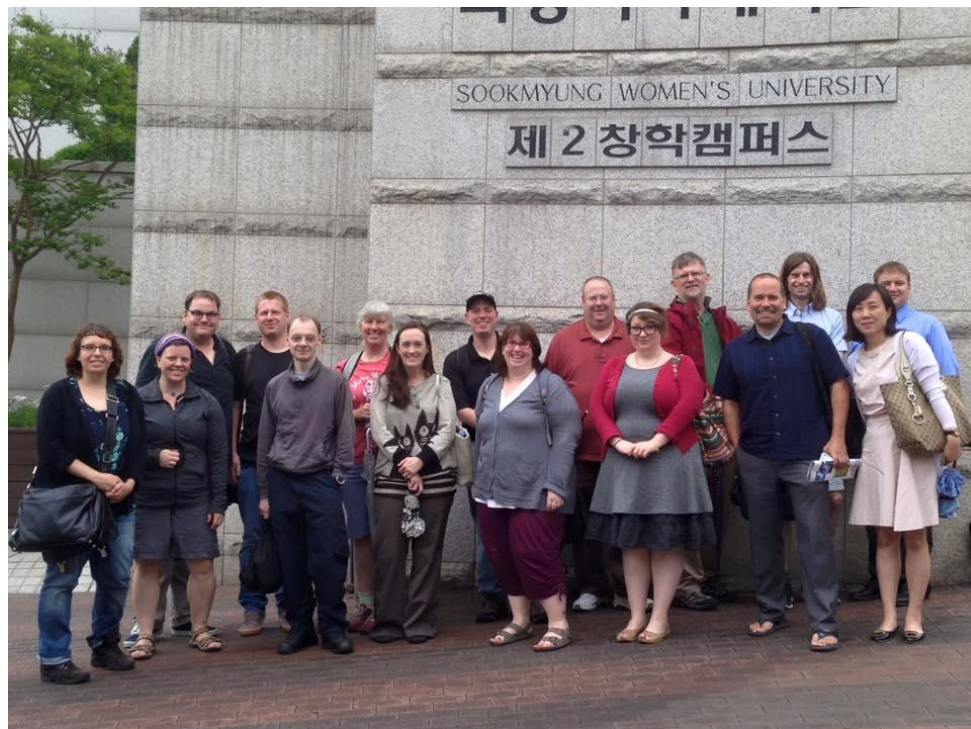
KOTESOL NATIONAL CONFERENCE: SOOKMYUNG UNIVERSITY, SEOUL