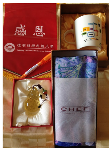
Gifts for PAC (ornament) + all VIPs and presenters at Friday night dinner (Takming Univ. scarf, mug, mini-banner)