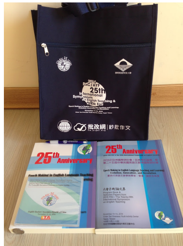
Bag & contents (program book, special collection of papers, pen, CD-ROM of program & special publication)