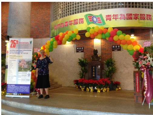
Near the registration area