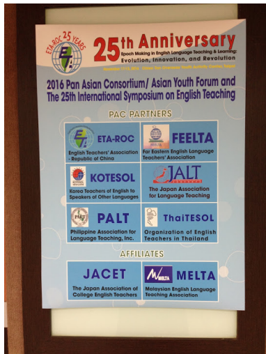
PAC sign in the plenary hall