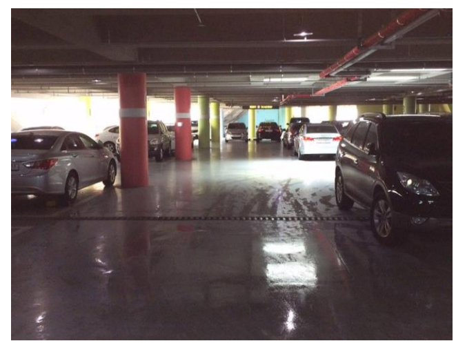
(Head to the pale green (B) section)