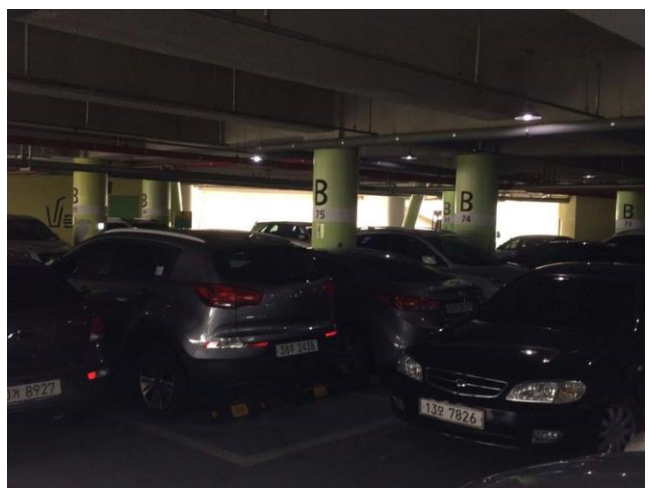
(Find a place to park)