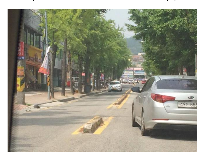
Go under the Star Tower (dormitory),

Walk up the street with restaurants and shops,