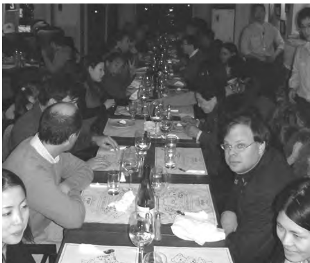
The annual Christmas Dinner - a Seoul Chapter tradition.