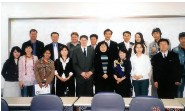
Suwon-Gyeonggi Chapter members attending their 49th chapter meeting on April 15th.