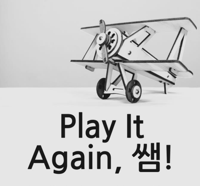
Revisitation, Reprise, Memory, Time

hether it's PowerPoint, translation tools, or games like Kahoot!, technology has become a crucial tool in the EFL classroom. While it can provide students with novel experiences, it can also be overwhelming and create confusion for students and teachers alike. In this presentation, we will discuss the challenges we face when using technology in our own classrooms and pitfalls to avoid when trying to implement technology into our lessons. We'll look at some programs, websites, and apps that may help you in your lesson planning. Teachers will also be encouraged to share what has worked for them in the past by adding suggestions to an idea bank that will be accessible online for future reference.