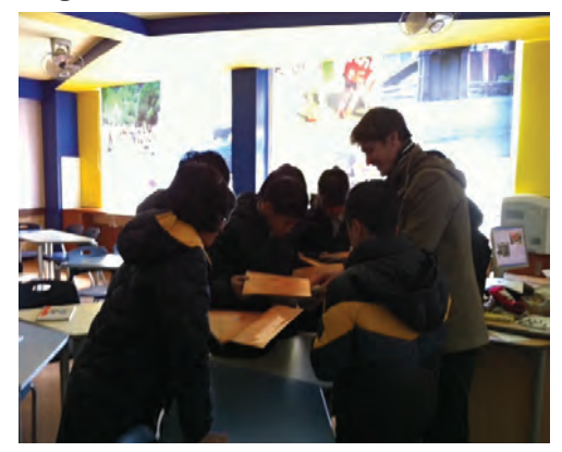
Students eager to receive their stamps

In a public middle school classroom, it is frustrating to see students arrive to class without their textbooks. In an effort to change this behavior, I developed an individual reward system that encourages students to not only arrive to class with their textbooks, but also encourages students to participate in class. The individual reward system, called Stampfest, uses ink-stamps to recognize student progress or desired classroom behavior. At the beginning of the school year, I list a number of ways students can obtain stamps. This includes completing homework, volunteering in class, demonstrating quality work, or finding ways to practice English outside of the classroom (such as writing book/movie summaries). If a student performs any one of these behaviors, they are rewarded with a stamp in the back of their English textbook.