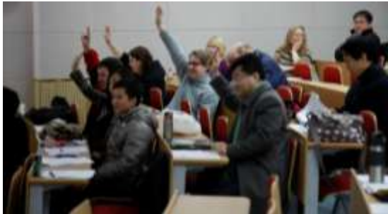
Voting on a motion at the National Council Meeting.

On Sunday, while many officers and members attended the web training, I stayed behind for the duration of the National Council meeting.