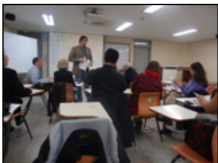
Top: Symposium 2011 Bottom: Symposium 2012

The DC Chapter will be hosting KOTESOL's National Conference on May 25. The conference will be held at Korea National University of Education (between Cheongju & Jochiwon) where the Conference Committee is striving to bring in international powerhouse speaker(s) with the focus on professional development.