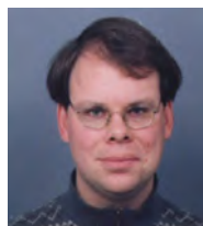
Immediate Past President: