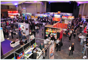
ELT Resources Exhibiton 2016

14 Pre-Conference Events (PCEs), organised by our Special Interest Groups, plus IATEFL's Associates' Day, will take place on Monday 3rd April.