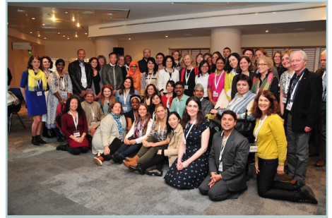
Scholarship Winners & Sponsors in Birmingham, 2016

The Scholarship application deadline is 21st July 2016 at 4pm, UK time